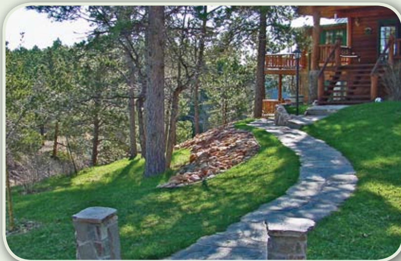
Fire burns faster uphill, making the removal of vegetation farther out essential to slow the fire down.

Under most conditions, protective measures in a 100-foot zone around a home are sufficient to protect the home from wildfire damage. Fire scientists have shown that large flames of a high-intensity wildland fire typically do not ignite homes at distances greater than 100 feet. A home's materials and design in relation to the vegetation within 100 feet is what determines the potential for a home to ignite.