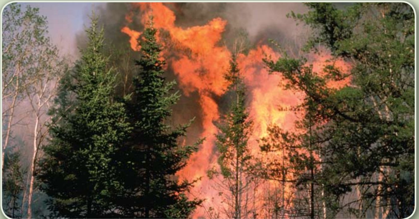
A crown fire in the tree canopy.

"...HAVING UNDEVELOPED WOODLANDS AND FIELDS IN AND AROUND A NEIGHBORHOOD MEANS THAT RESIDENTS SHOULD KNOW HOW TO PREPARE THEIR HOMES..."