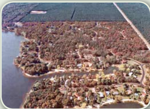
In many localities, good fire prevention requires cooperation among neighbors.

Residential developments within the wildland-urban interface often include a higher density of housing than typically found in more rural areas. In these cases, an individual's Home Ignition Zone might overlap that of a neighbor's. In these developments, if one property owner does everything possible to improve the condition of their property and the