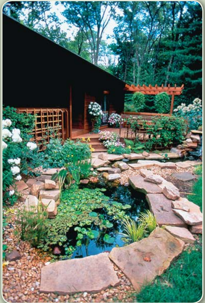
FireSmart landscaping can be both effective and attractive. This pond beautifies the lawn and provides additional fire protection.

This publication is available from county UW-Extension offices, Cooperative Extension Publications – 1-877-947-7827, and from DNR Service Centers.