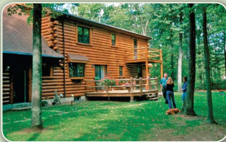
A well-managed Home Ignition Zone helps keep wildfire away.

Crown fires can catapult burning embers onto your property, including your home. Crown fires are the most destructive of all wildfires, able to kill mature trees and shrubs, and can move over large areas in short periods of time. Some surface fires, especially grass or marsh fires, can move very fast and cause great injury or even death when they are underestimated. Surface fires can become crown fires in stands where there are "ladder fuels" (i.e. branches that extend to the ground and allow a fire to climb up a tree to its crown).