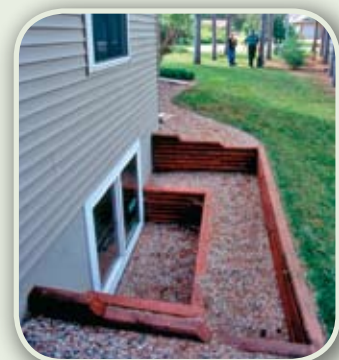
A 3-to-5-foot "fuel free zone" keeps flames away from siding.

Moving farther away from the house, landscape trees, shrubs and plants should be managed to ensure that any fire in this area remains on the ground and burns quickly (i.e. no smoldering) and with low intensity. That means keeping the lawn clean of fallen pine needles and leaves.