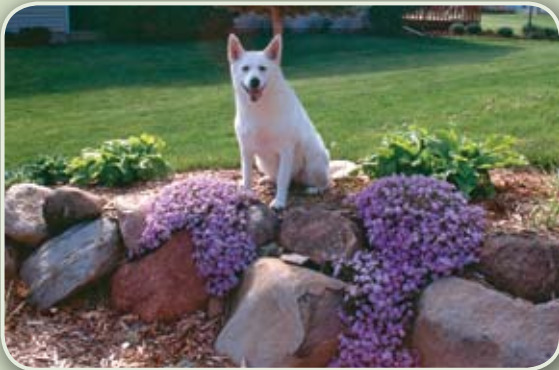
Rock walls are another creative, FireSmart landscaping choice.