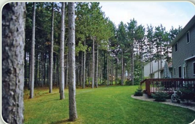
Pine trees need to be kept well spaced and pruned high.

Outside the HIZ, fire can essentially burn unabated without causing a home to ignite. However, it is important to note that most homes do not burn from high intensity fires. Most of the homes lost to wildfire in the Great Lakes region burn either from surface fires in the wake of the main fire front, or from the accumulation of windblown firebrands in advance of the fire. Simply put, FireSmart landscaping and maintenance is critical.