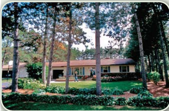
A FireSmart yard in a pine forest.

Many new homeowners build within pine forests and then struggle with maintaining the aesthetic nature of the forest while protecting their