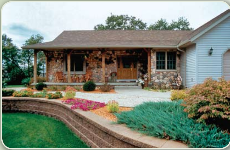
This raised garden bed is an attractive, low-maintenance, and fire-resistant landscaping choice.