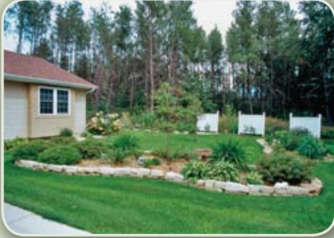
Garden "islands" keep plants isolated and away from your home's siding.