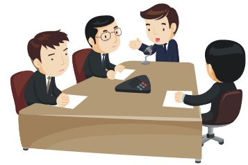
Council Meeting Dates and Times

You are always invited to attend council meetings, understanding that members of the public do not have an automatic right to speak during the meeting. Interested in running for a seat next year? Come out to a number of meetings to see what's in store or if its for you. Remaining 2013 meetings are November 8 and 22 and December 13 at 2:00 p.m.