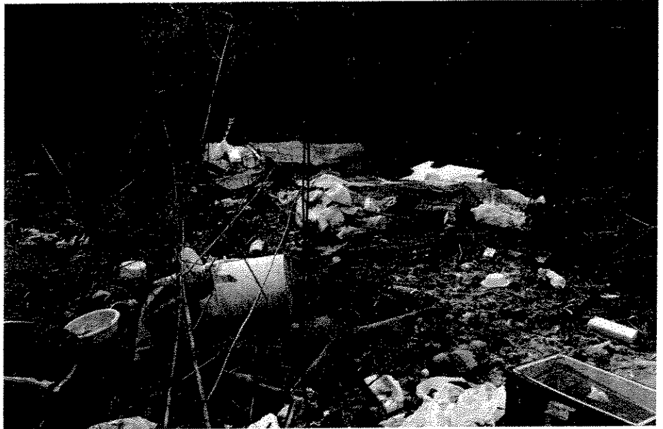
Amazing but true. People actually do this.

Ministry of Natural Resources conservation officers actively pursue people who improperly dispose of garbage on Crown land. The maximum penalty for dumping garbage on Crown land is $10,000 plus