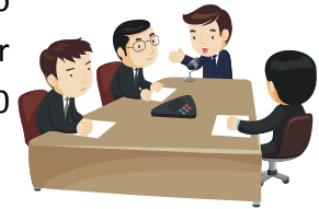
Council Meeting Dates and Times

Council minutes may be located on website; which will soon have a new look.