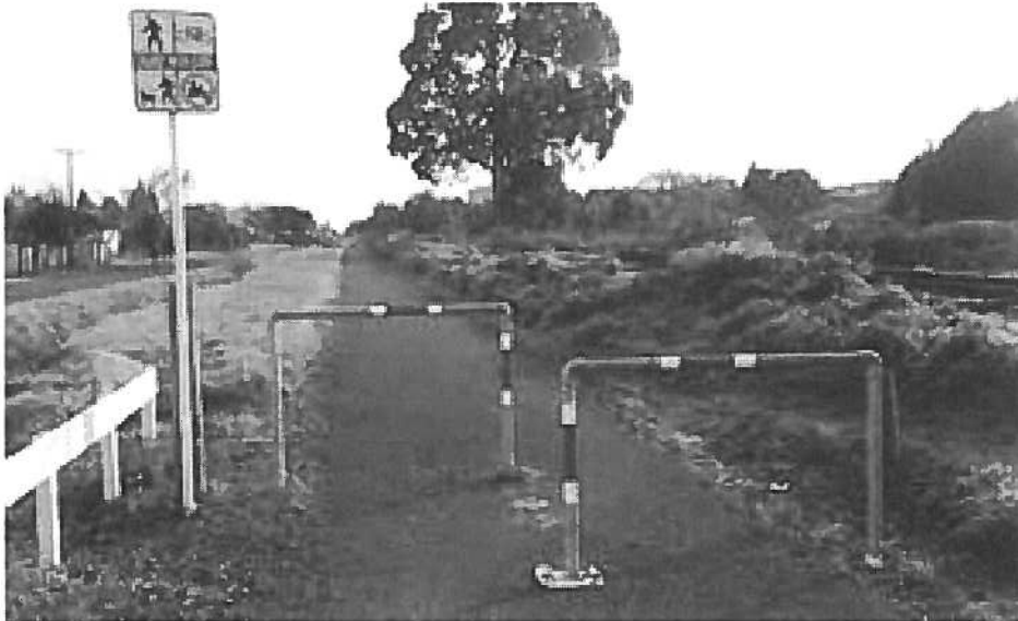
Photo of type of barriers expected. Could be created with pressure treated lumber, steel posts? Made completely of reflective material? Lit to increase awareness? Signed etc.? Options are numerous. They could be made out of material which would give/break if someone hit them? They are used in other locations for this exact purpose.