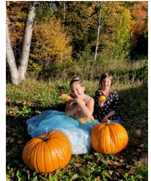
Award winning pumpkin growers in Bissett Creek received certificates for accepting the Mayor's Pumpkin Challenge!

I made an October visit to Bissett Creek to award a certificate of appreciation to sisters for accepting the first ever "Mayor's Pumpkin Challenge." You may ask, "what is the mayor up to now?" At the June Jazaar in late spring, I hosted the Municipal table and offered free pumpkin seeds to any child who would take the challenge and try to grow a beautiful Halloween Pumpkin.