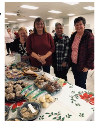
Library Board bakers at the Christmas Craft Show