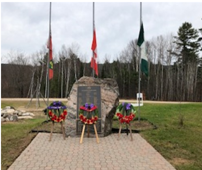
2022 Remembrance Day Memorial