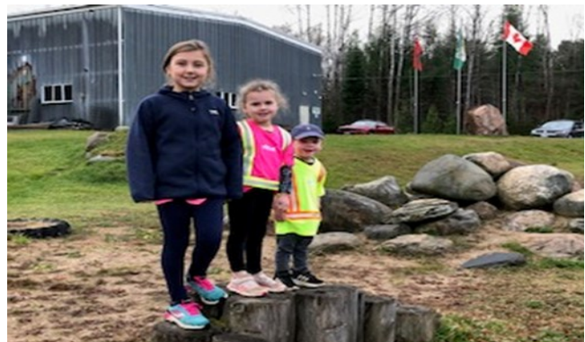
Happy children enjoying our playground!